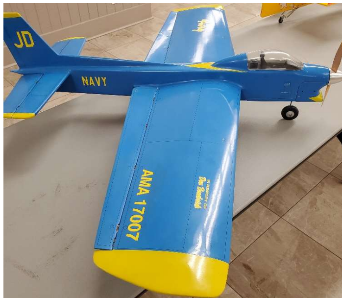
Jim Deutsch's Fury CL Plane

Jim Deutsch brought in his Fury Control-line stunt plane (below.) An all-balsa/dope model sporting an OS Max 40 engine. Jim said he has about 500 flights on it...and zero crashes. Excellent piloting in the circle Jim!