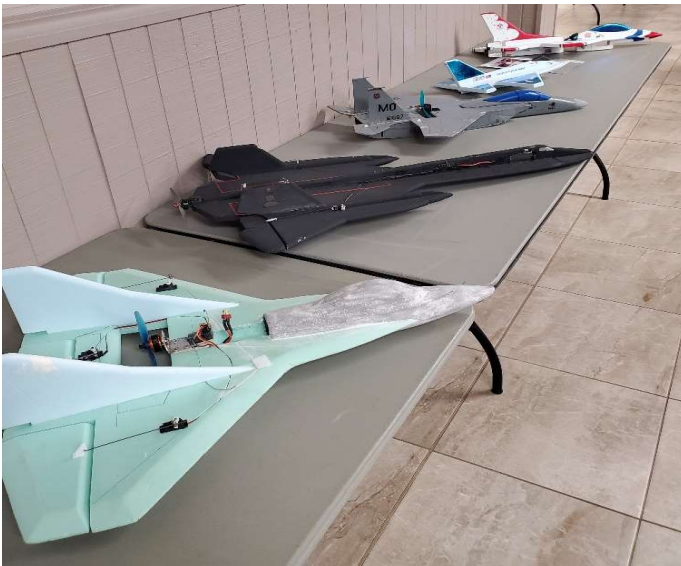
Lloyd Adkins' Foam Planes

Lloyd also brought in his Seagull Models Ultimate Biplane ARF (below right.) It uses a Badass Motors 45/20 370 Kv motor with a 6S 5000mAh battery, has a 16"prop and weighs 13 lbs. Nice biplane!